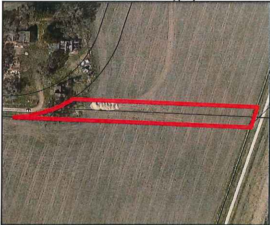
2016 Aerial Photograph

Note: Subject properties are highlighted in red.